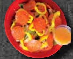
REGULAR ITALIAN SALAD

Mixed greens with white onions, green peppers, banana peppers, roma tomatoes and pepperoni. Regular 6.25 / Dinner 9.25