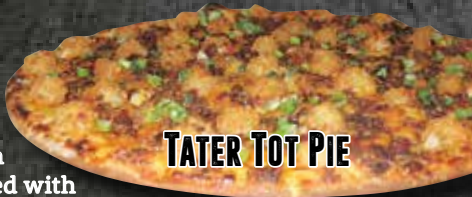
TATER TOT PIE